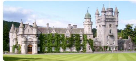
Balmoral Castle is in Aberdeenshire, Scotland.