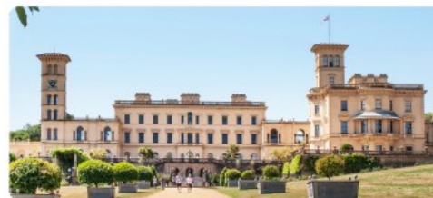
Osborne House is on the Isle of Wight, England.