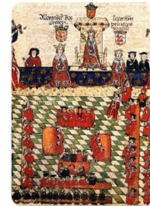
Edward I and the Model Parliament

The power of the monarchy has changed over time. In the past, some monarchs had absolute power. This meant that they could do whatever they wanted. Today, there is a constitutional monarchy. This means that the monarch is controlled by parliament and the government.